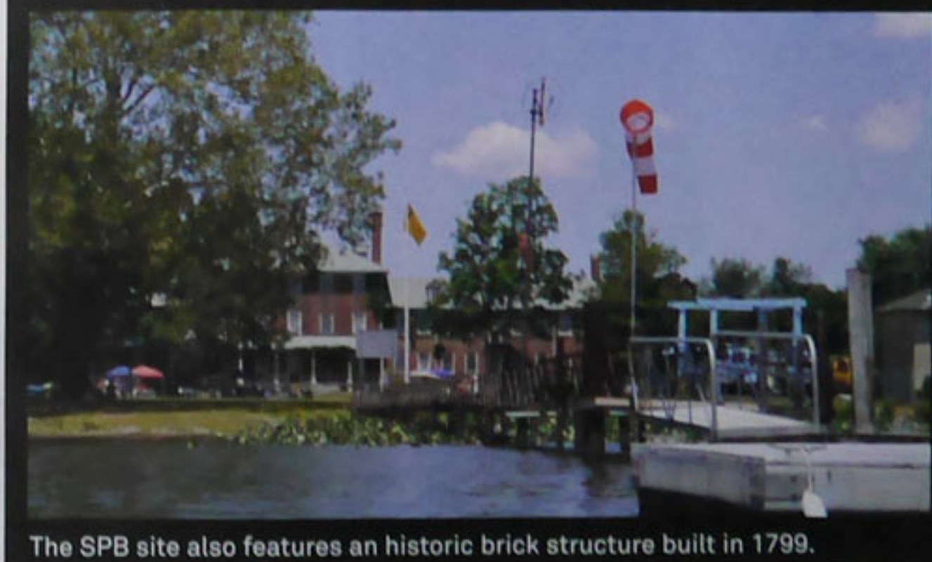
The SPB site also features an historic brick structure built in 1799.

FOR LITTLE MORE THAN THE COST OF OVERHAULING YOUR HEAVY OLD STARTER, YOU COULD ENJOY A NEW LIGHTWEIGHT