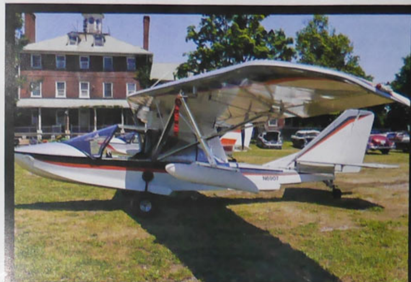
Seareys dominated splash-in contingent.