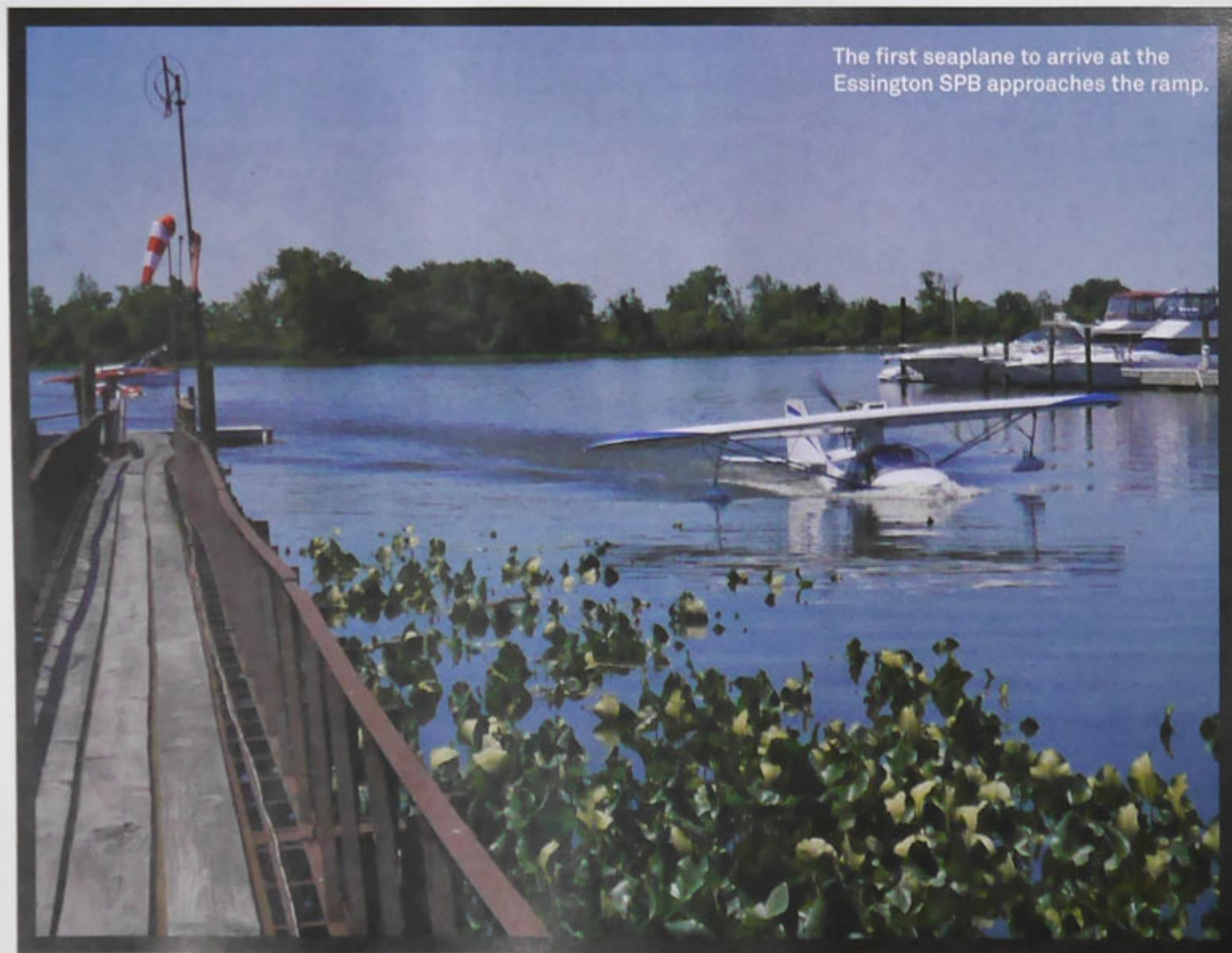
The first seaplane to arrive at the Essington SPB approaches the ramp.

Although real improvements at the seaplane base are probably a couple years away, it was nice to see so much seaplane activity here, if only for a few hours. Thanks to all who helped make it happen. ■