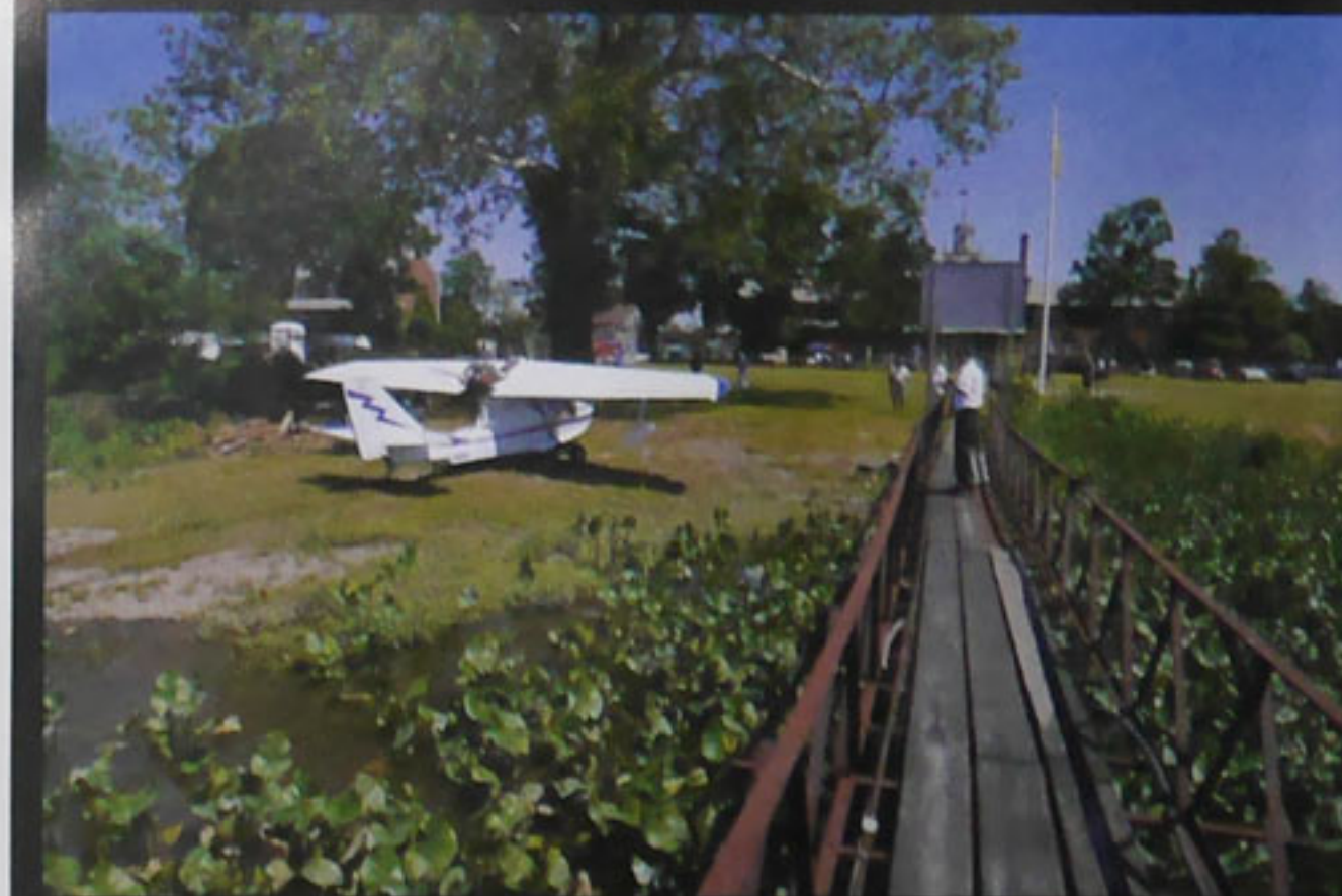
Natural ramp leading to broad grass parking area is a bit rocky, but negotiable.